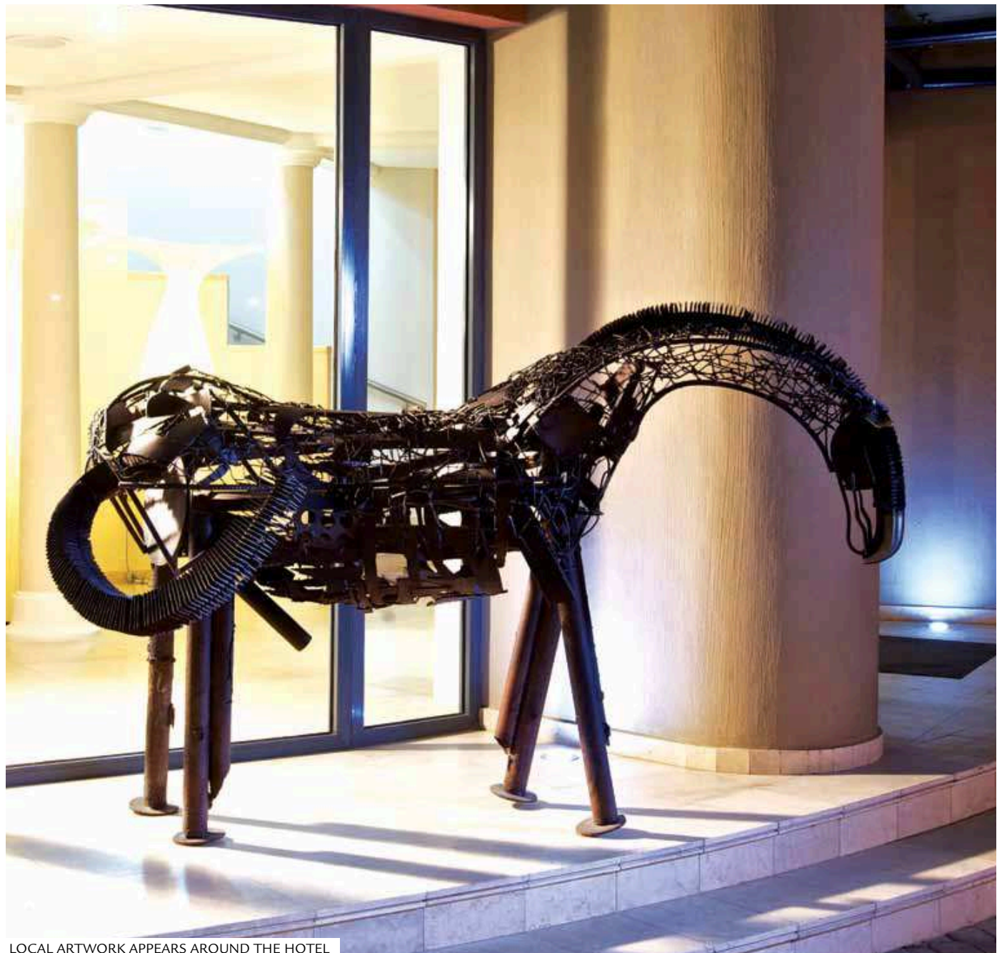
LOCAL ARTWORK APPEARS AROUND THE HOTEL

As befits a five-star hotel, The Wheatbaker offers a choice of two superb dining experiences. The premier Grill Room and Bar with its à la carte menu bids the diner relax and enjoy sumptuous cuisine and what is probably the most extensive wine list in Lagos. The Seraya Deli, in turn, is a