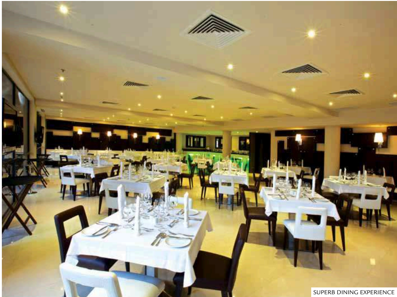
SUPERB DINING EXPERIENCE

Driving into the property you will be forgiven if you for a moment forget that you are in the heart of Lagos. The welcome area is the perfect backdrop to the expertly architected building with its contemporary lines, stone clad exterior walls and floor to ceiling windows. The reception of the hotel is open and inviting, providing guests an exquisite taste of what is to come when visiting this five-star hotel.