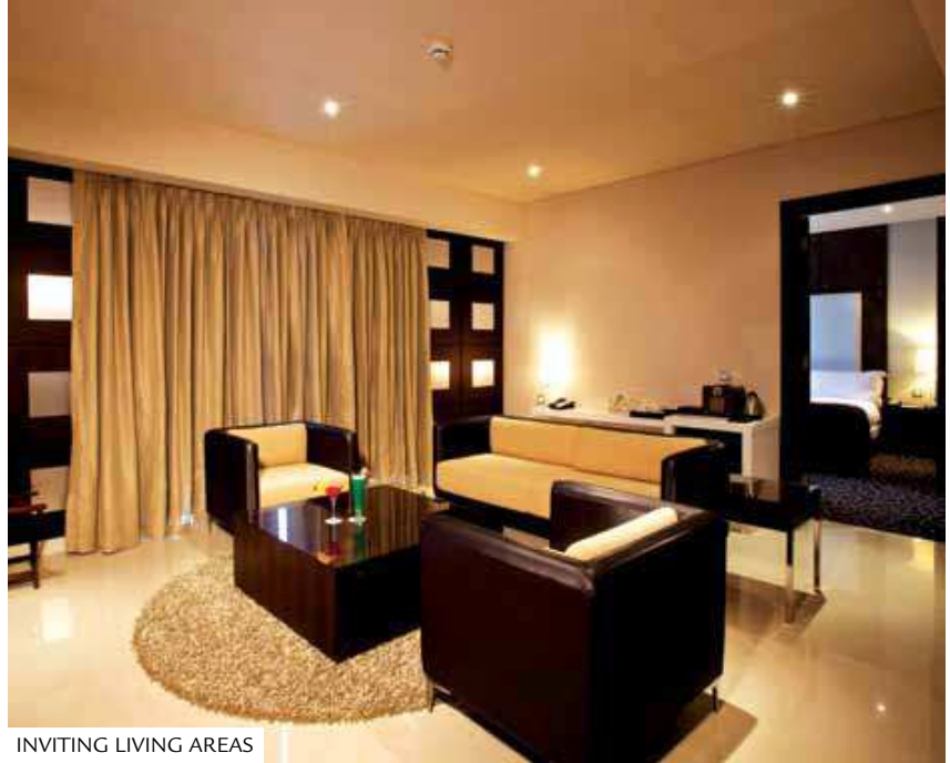
INVITING LIVING AREAS

Built on the site of a grand old house, some parts of which have been retained in the design, The Wheatbaker has a graceful flow and elegant lines that are accentuated by the manner in which natural light has been maximised in its architectural design. The net result is a light and airy ambience that is complemented by contemporary classic décor and earthy tones that reflect the colour and emotion of the great African city that it calls home.