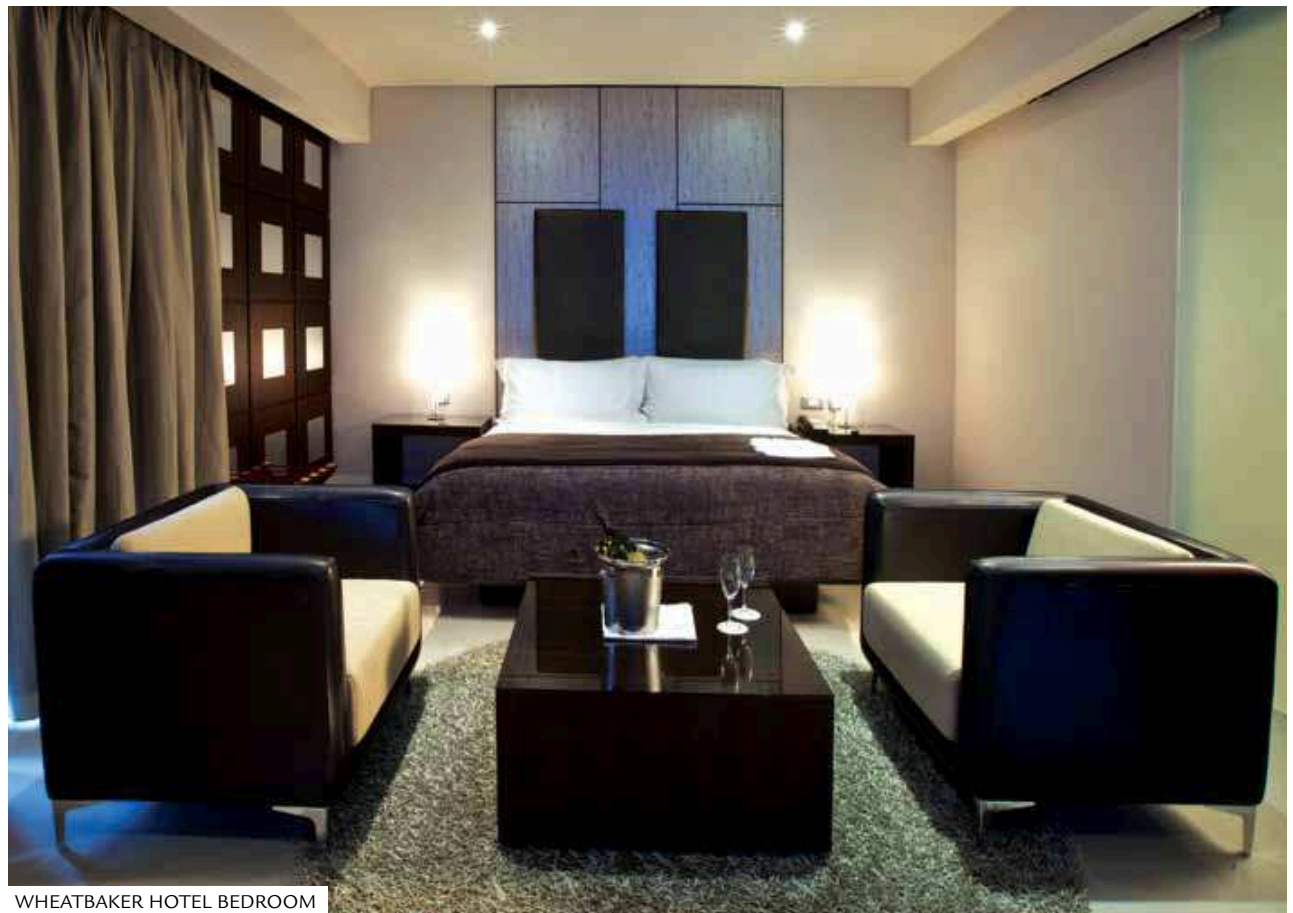
WHEATBAKER HOTEL BEDROOM

Displayed throughout the public areas of The Wheatbaker, superb pieces of Nigerian art celebrate the immense depth of artistic talent of a country that is creative to its core