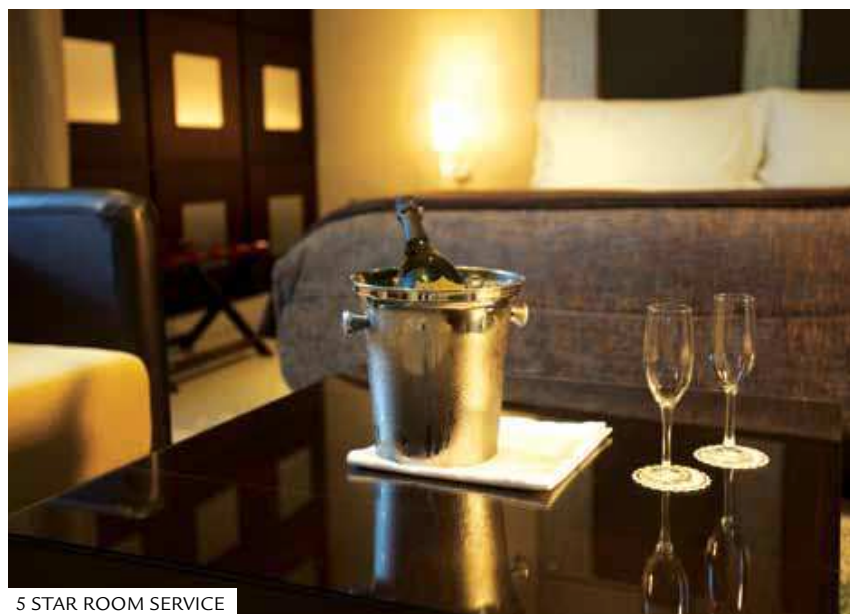
5 STAR ROOM SERVICE

Driving into the property you will be forgiven if you for a moment forget that you are in the heart of Lagos